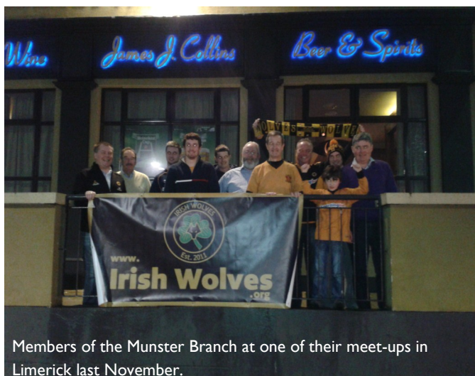
Members of the Munster Branch at one of their meet-ups in Limerick last November.