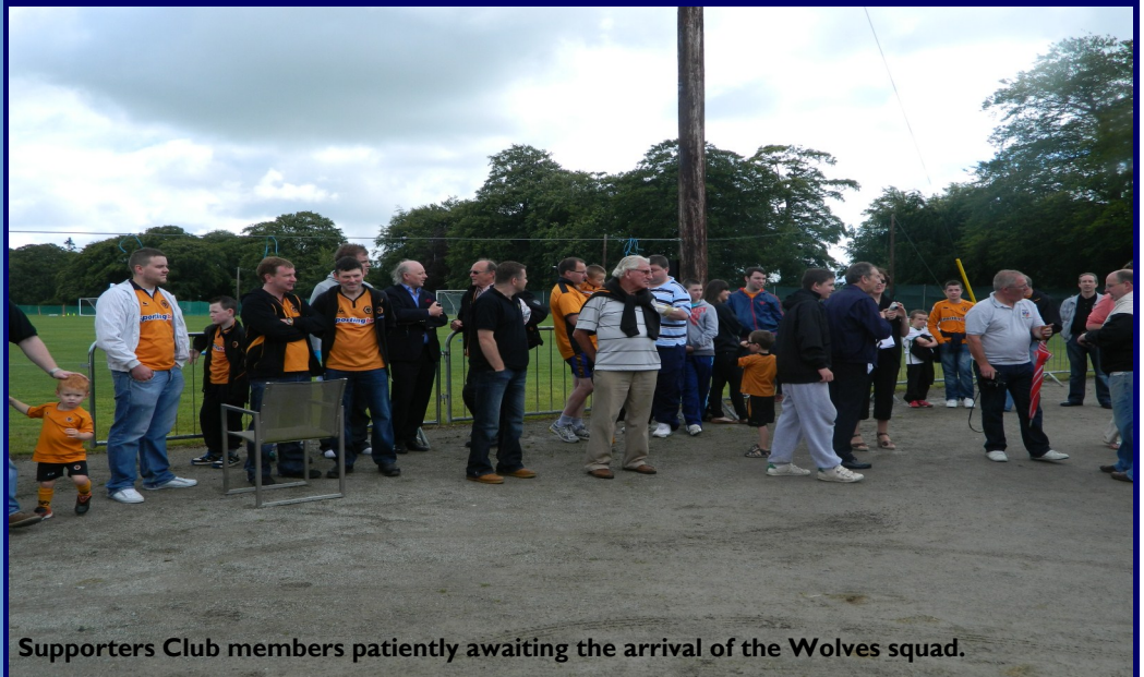
Supporters Club members patiently awaiting the arrival of the Wolves squad.